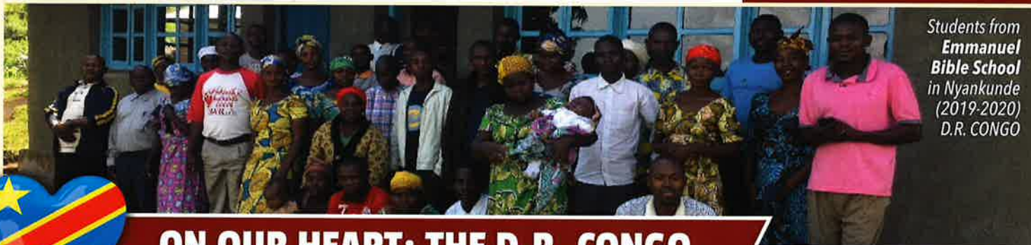
Students from Emmanuel Bible School in Nyankunde (2019-2020) D.R. CONGO

Our risen, glorified Christ counsels every Christian to buy these things. The word "buy" is not literal as spiritual items cannot be purchased with money. So what does Christ mean? We "buy" real gold by saving up treasures in Heaven (Mt 6:20). We "buy" white clothing by living righteous lives (Rev 19:8). We "buy" eye medicine by beholding the glory of the Lord (2 Cor 3:18). Is it time to update our spiritual shopping list today?